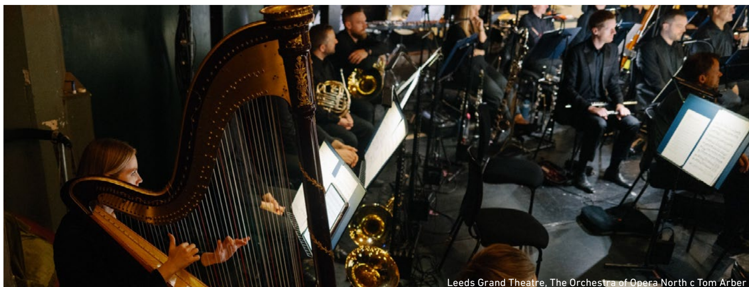
Leeds Grand Theatre, The Orchestra of Opera North

Experience the multi-Academy Award-winning film Amadeus with Mozart's music performed live by the Orchestra and Chorus of Opera North. operanorth.co.uk