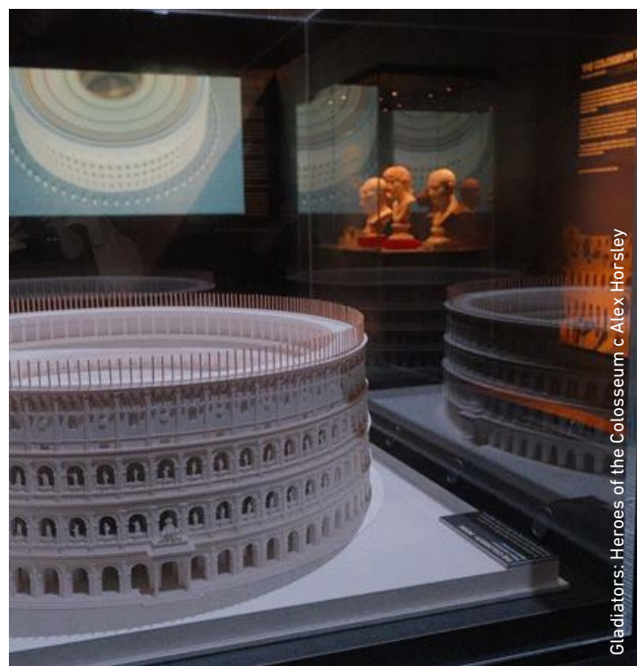
Gladiators: Heroes of the Colosseum

An exhibition showcasing work by key artists in British Land Art including Tacita Dean, Andy Goldsworthy and David Nash. henry-moore.org