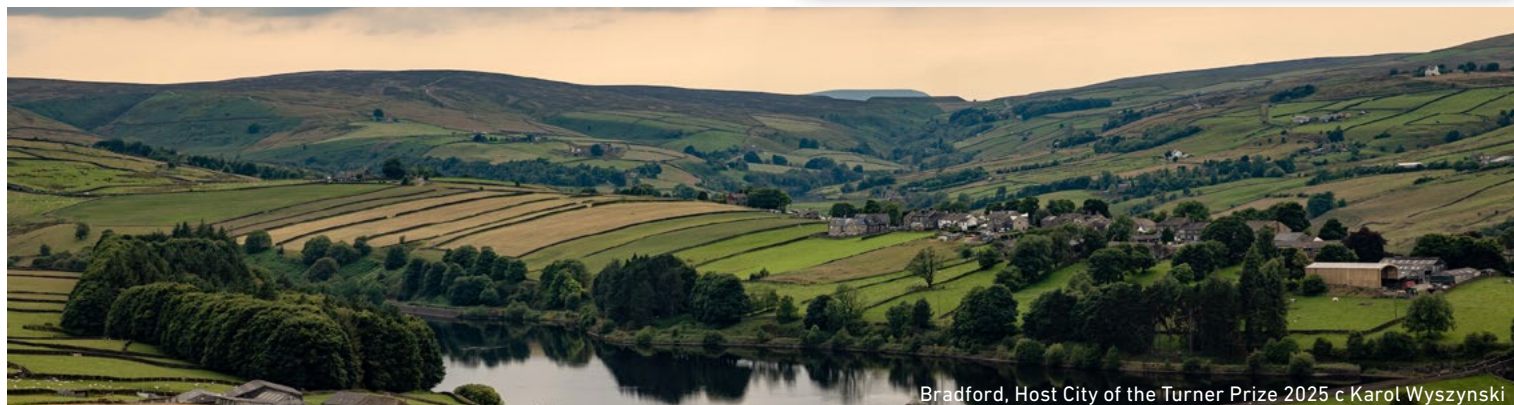
Bradford, Host City of the Turner Prize 2025