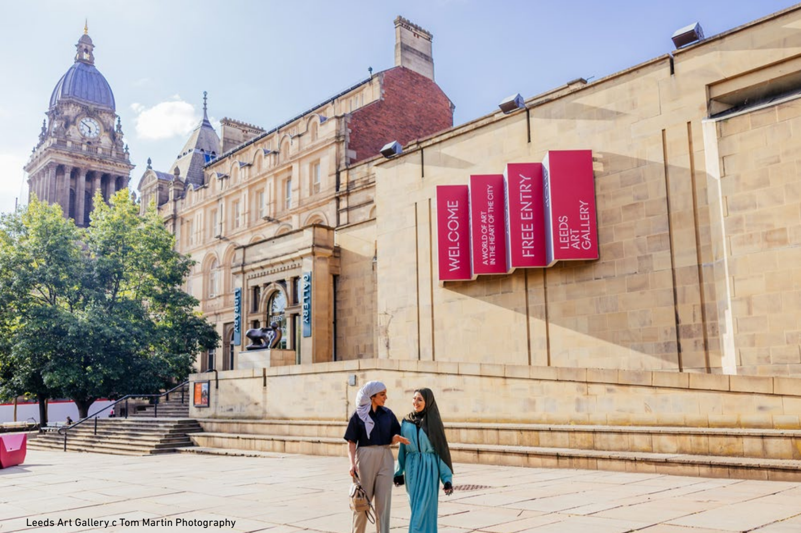
Leeds Art Gallery