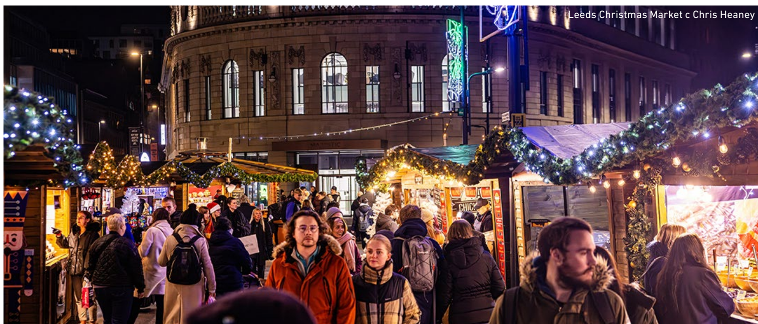
Leeds Christmas Market