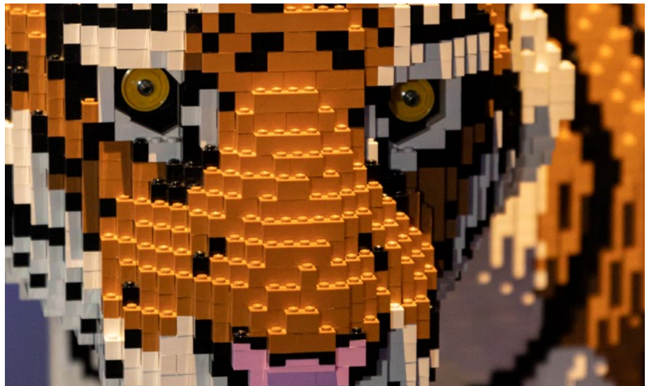
Lego-The Art Of The Brick Fever 5

This internationally acclaimed exhibition featuring over a million bricks comes to Leeds. Featuring re-imagined masterpieces in Lego, including Leonardo Da Vinci's Mona Lisa, Van Gogh's Starry Night and Michelangelo's David, as well as a Lego Safari and multimedia exhibit of Lego photography. feverup.com