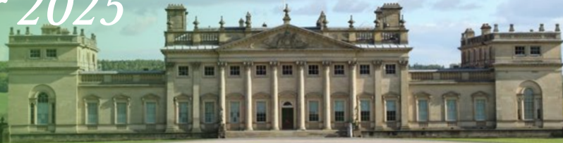
Harewood House