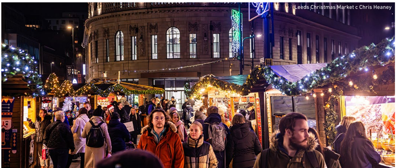
Leeds Christmas Market