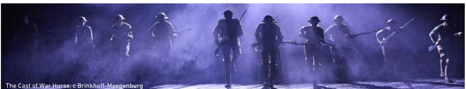
The Cast of War Horse

One of the biggest events in the North of England, Leeds West Indian Carnival is a welcoming celebration which brings the joy of carnival to everyone, on August Bank Holiday Monday. It is one of the longest running and largest Carnivals in the UK. leedscarnival.co.uk