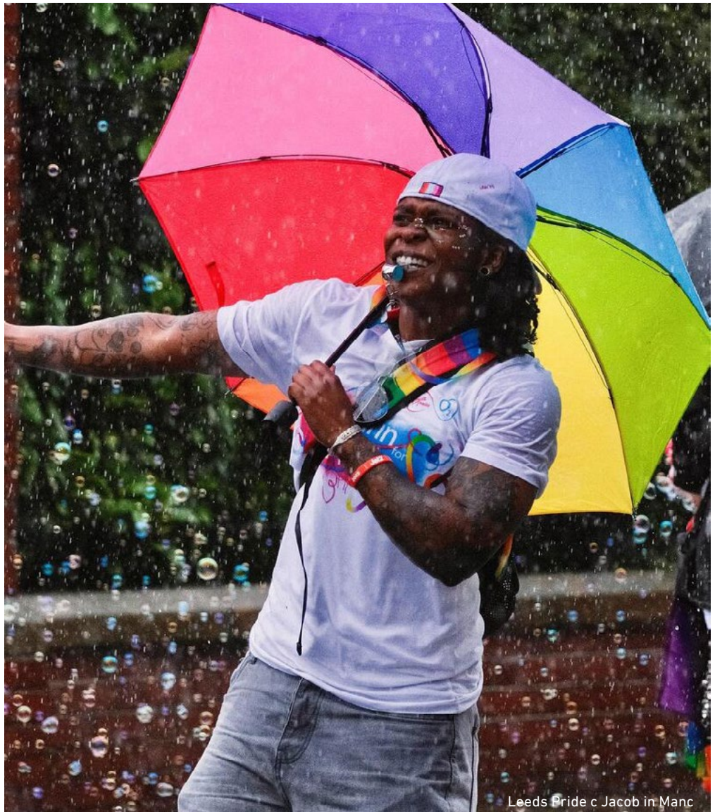
Leeds Pride

We're a city that loves to entertain, with a jam-packed event programme all year round. Please note that the information contained in this document isn't an exhaustive list of the events in the annual Leeds calendar. To find out more about all the events taking place in Leeds this year, please visit: visitleeds.co.uk/whats-on