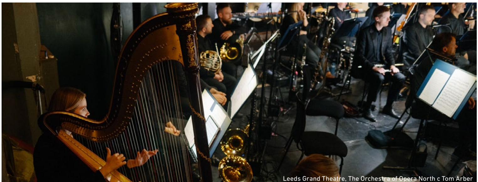
Leeds Grand Theatre, The Orchestra of Opera North

Experience the multi-Academy Award-winning film Amadeus with Mozart's music performed live by the Orchestra and Chorus of Opera North. operanorth.co.uk