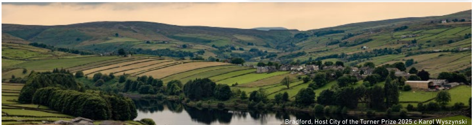
Bradford, Host City of the Turner Prize 2025