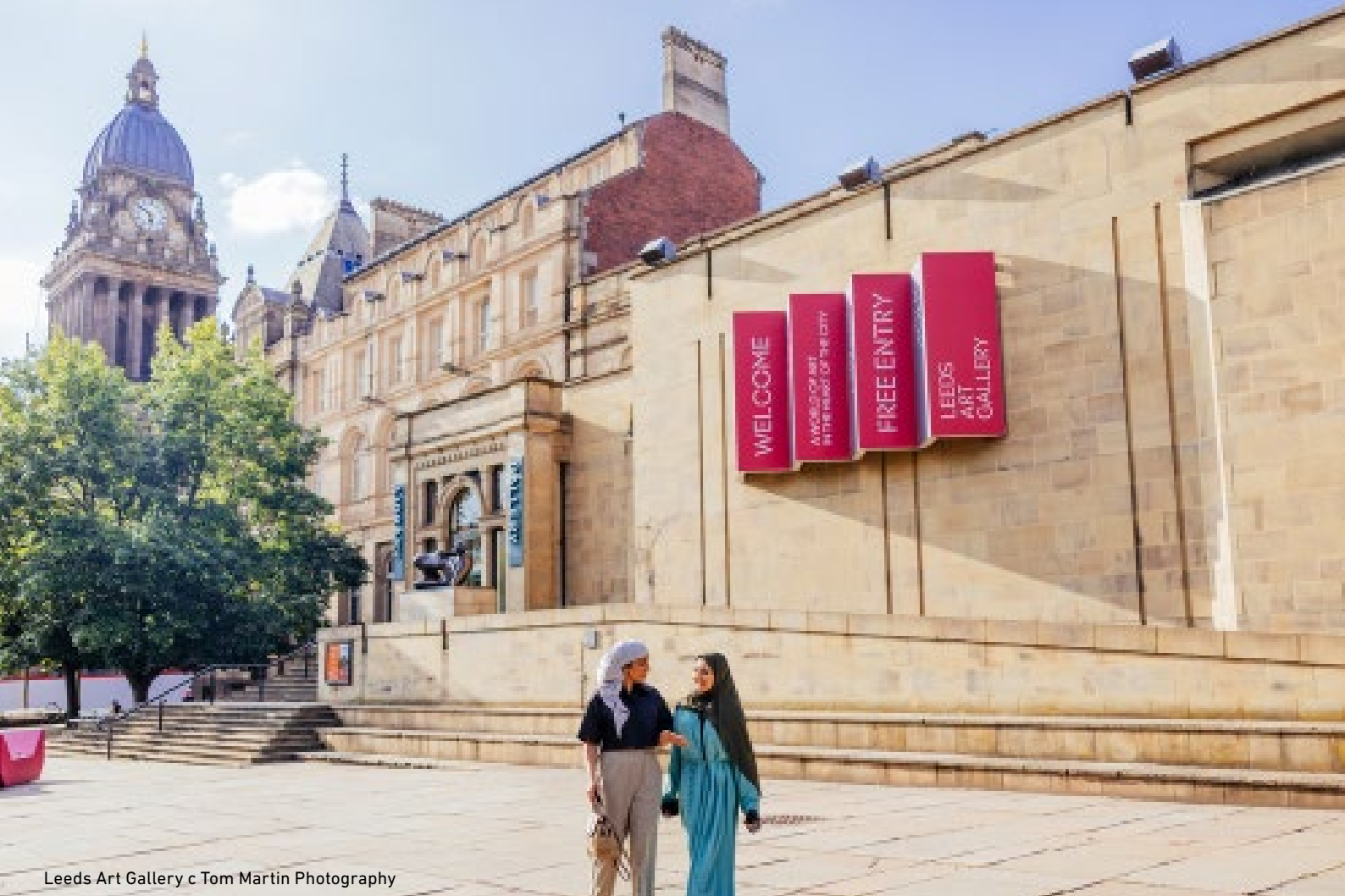
Leeds Art Gallery