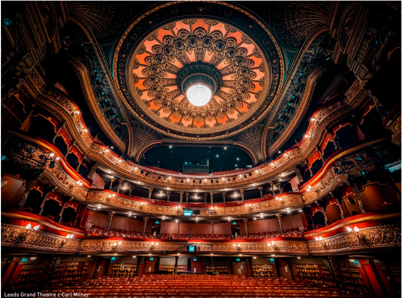
Leeds Grand Theatre

Find out why Leeds is the place to be all year round. Play video