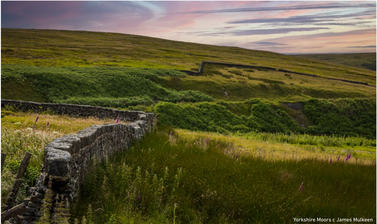
Yorkshire Moors

Love Leeds for longer with a day trip from Leeds. Find out more.