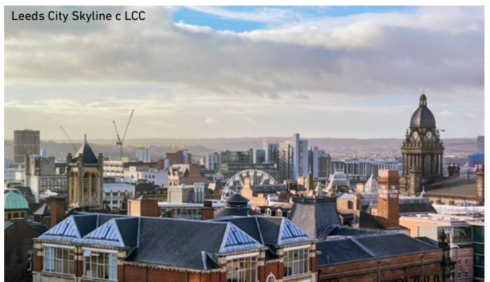
Leeds City Skyline