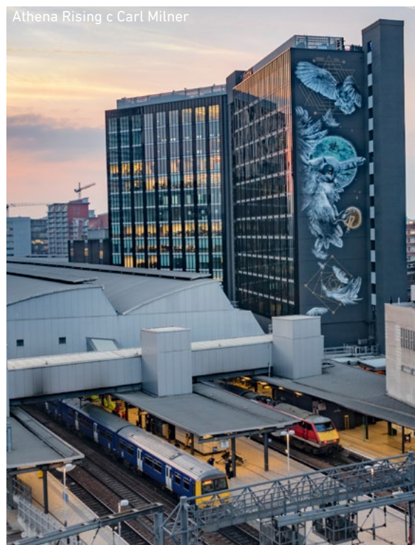
Athena Rising c Carl Milner

LEEDS: 200 MILES SOUTH OF EDINBURGH, 200 MILES NORTH OF LONDON, WITH HULL AND MANCHESTER JUST UNDER 50 MILES TO THE EAST AND WEST RESPECTIVELY, LEEDS IS ARGUABLY THE CENTRAL POINT IN THE UK. A DESTINATION IN ITS OWN RIGHT, LEEDS IS ALSO THE GATEWAY TO THE SURROUNDING YORKSHIRE COUNTRYSIDE AND BEYOND.