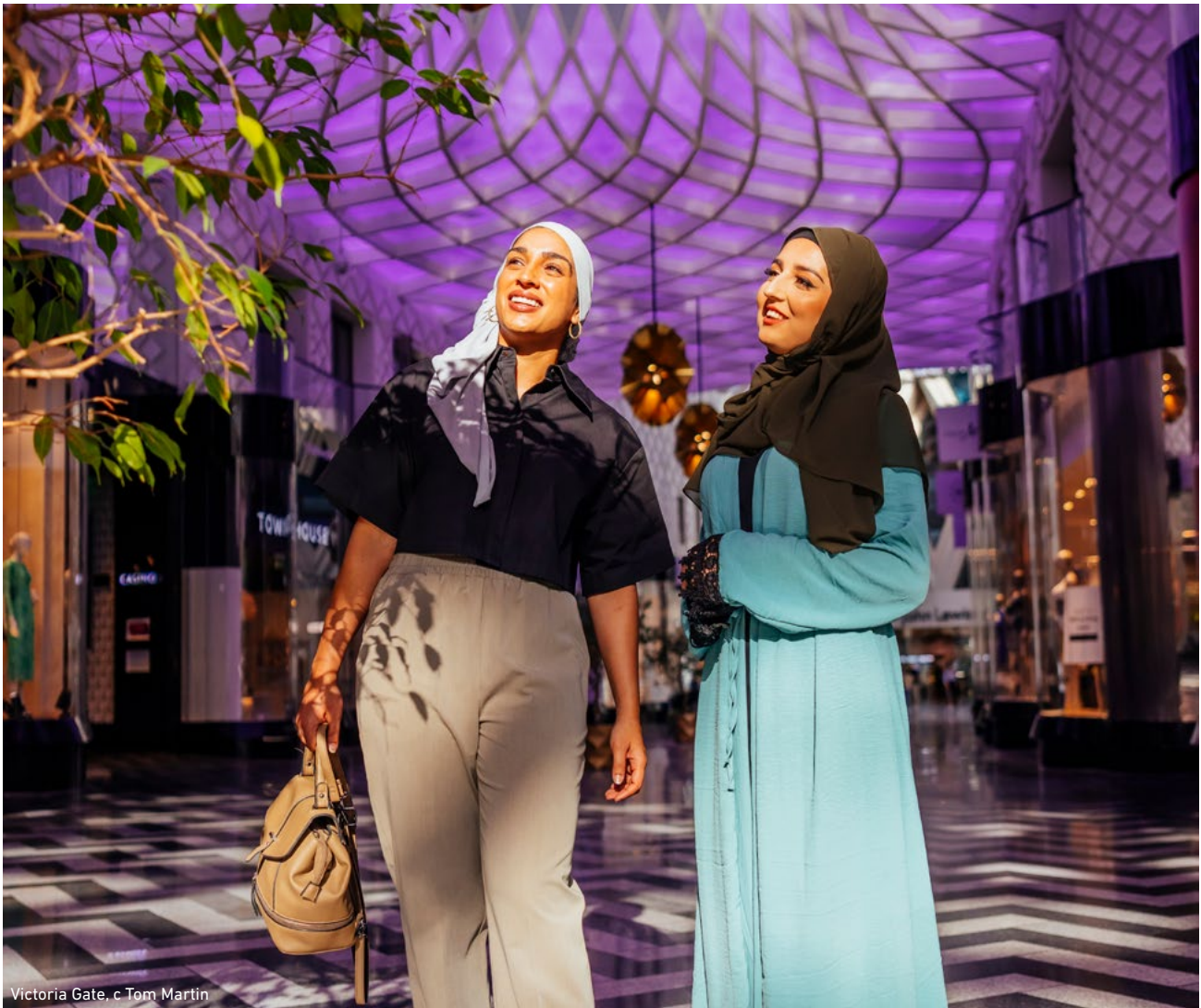
Victoria Gate

Leeds is a shopper's paradise. A world of retail, all within easy reach and on some of the most handsome, wide Victorian-made streets lined with striking buildings whose upper floors and rooftops mean shoppers should look up when in Leeds. Now pedestrianised, our compact and walkable city centre means you're never far away from the biggest brands. The stunning Victorian arcades, each with its own distinct identity, lead off the main shopping streets, so whether it's the swanky Victoria Quarter – complete with the largest single work of stained glass in Great Britain and the largest stained glass roof in Europe – or the smaller Thorntons, Grand or Queens arcades full of eclectic and independent stores, salons and