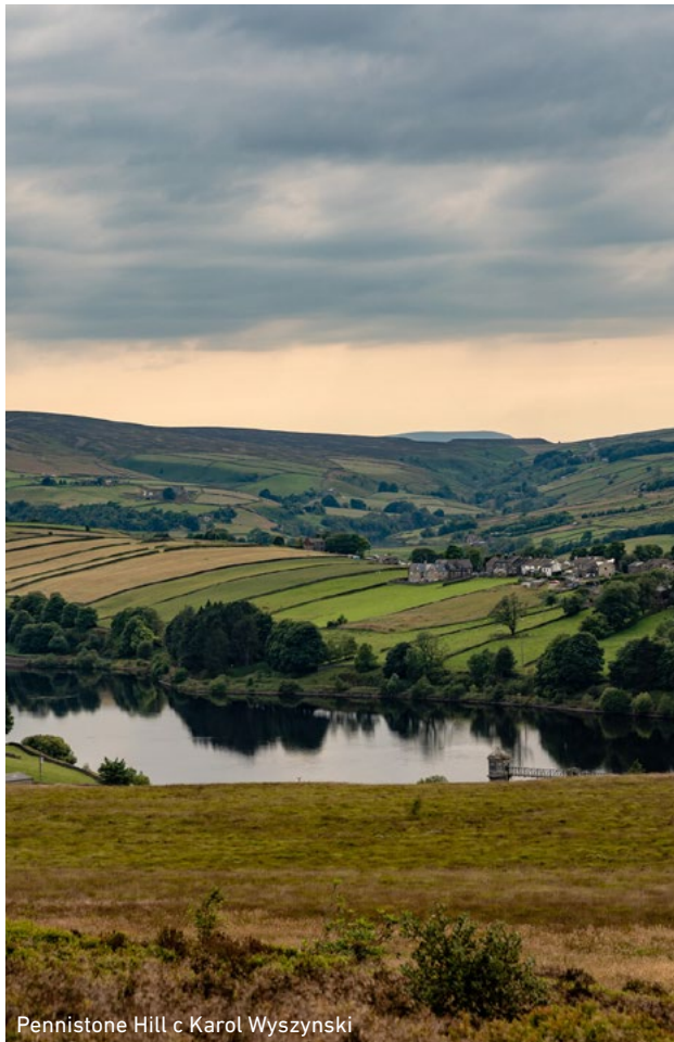
Pennistone Hill

Leeds is a city made by its people and with a cultural pedigree that includes Barbara Hepworth who studied at Leeds School of Art (now the Leeds Arts University), Henry Moore, Damien Hirst; Spice Girl Mel B, the Kaiser Chiefs and Mercury Music Prize winners English Teacher (2024), plus nominees Corinne Bailey-Rae (2024) and Yard Act (2022). The city is always evolving and delivering its own brand of creativity.