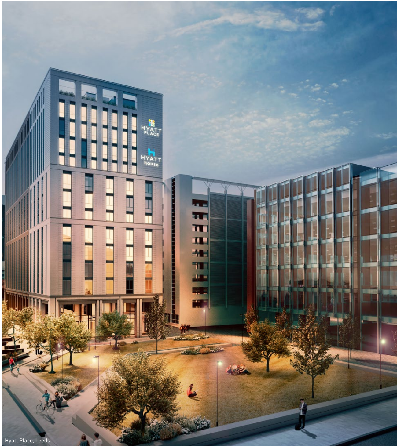
Hyatt Place, Leeds

Whatever your trip entails, and whatever your budget, you'll find somewhere to stay that's so much more than a base. From the UK's first 'Art Hostel' to luxury hotels and international brands, buzzing boutiques to exceptional self-catering apartments, or for those who love the outdoors there is a great selection of local camp sites in the neighbouring dales and moors. The choice is yours.