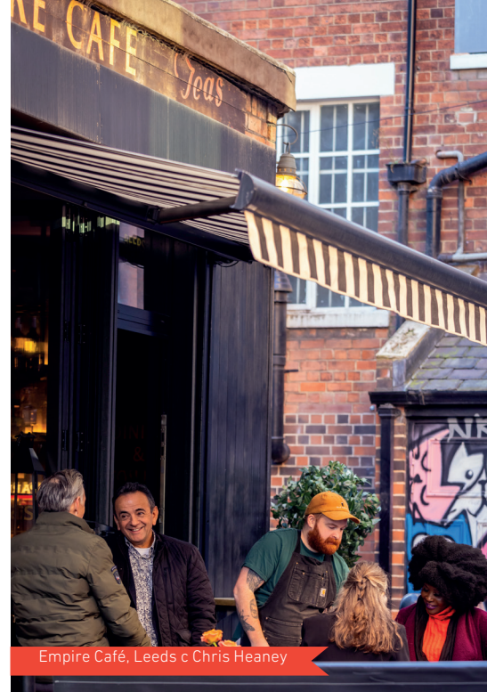
Empire Café, Leeds