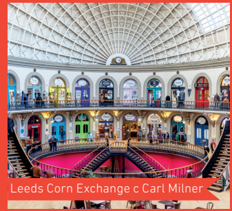
Leeds Corn Exchange

A renowned retail destination, where stunning Victorian arcades set the backdrop for an unrivalled shopping experience. The Royal Armouries, sister museum to the Tower of London has world-class exhibitions of arms and armour and Leeds Art Gallery has one of the most valued collections of British contemporary art in the UK. The majestic Kirkstall Abbey is one of the best-preserved Cistercian Abbeys in the country and Harewood House located just outside of the city, is one of the Treasure Houses of England and a perfect day-trip.