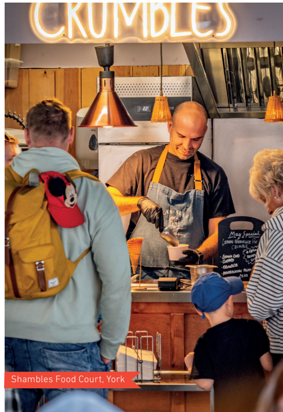
Shambles Food Court, York