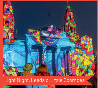
Light Night, Leeds