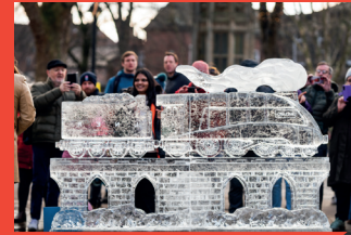
York Ice Trail

York is a vibrant festival city with Roman roots and a Viking past, offering an adventure for everyone. One of Britain's historic cities, this unique 2000-year-old walled city has more attractions per square mile than any other city in the UK. Boasting the National Railway Museum, one of the world's most magnificent cathedrals, York Minster, and the world-famous JORVIK Viking Centre, you'll find world-class museums, galleries and walking tours uncovering hidden secrets all within easy distance. Crowned Britain's home of chocolate and the most haunted city in Europe, York is abundant with culture and character, with a varied calendar of events and festivals year-round. Plus, the city's thriving creative and arts community has earned an esteemed UNESCO City of Media Arts status.