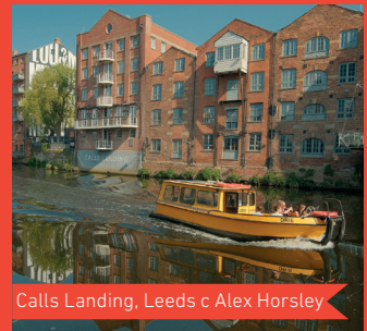
Calls Landing, Leeds