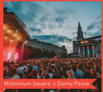
Millennium Square