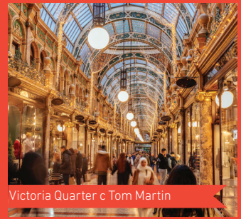
Victoria Quarter

A renowned retail destination, where stunning Victorian arcades set the backdrop for an unrivalled shopping experience. The Royal Armouries, sister museum to the Tower of London has world-class exhibitions of arms and armour and Leeds Art Gallery has one of the most valued collections of British contemporary art in the UK. The majestic Kirkstall Abbey is one of the best-preserved Cistercian Abbeys in the country and Harewood House located just outside of the city, is one of the Treasure Houses of England and a perfect day-trip.