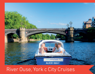
River Ouse, York