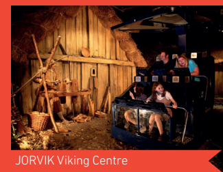
JORVIK Viking Centre

York is a vibrant festival city with Roman roots and a Viking past, offering an adventure for everyone. One of Britain's historic cities, this unique 2000-year-old walled city has more attractions per square mile than any other city in the UK. Boasting the National Railway Museum, one of the world's most magnificent cathedrals, York Minster, and the world-famous JORVIK Viking Centre, you'll find world-class museums, galleries and walking tours uncovering hidden secrets all within easy distance. Crowned Britain's home of chocolate and the most haunted city in Europe, York is abundant with culture and character, with a varied calendar of events and festivals year-round. Plus, the city's thriving creative and arts community has earned an esteemed UNESCO City of Media Arts status.