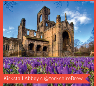
Kirkstall Abbey c @YorkshireBrew