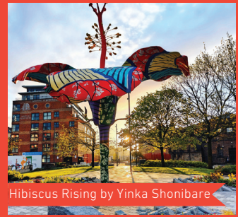
Hibiscus Rising by Yinka Shonibare

A renowned retail destination, where stunning Victorian arcades set the backdrop for an unrivalled shopping experience. The Royal Armouries, sister museum to the Tower of London has world-class exhibitions of arms and armour and Leeds Art Gallery has one of the most valued collections of British contemporary art in the UK. The majestic Kirkstall Abbey is one of the best-preserved Cistercian Abbeys in the country and Harewood House located just outside of the city, is one of the Treasure Houses of England and a perfect day-trip.