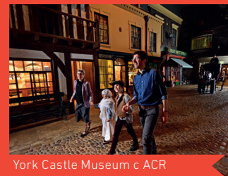
York Castle Museum

York is a vibrant festival city with Roman roots and a Viking past, offering an adventure for everyone. One of Britain's historic cities, this unique 2000-year-old walled city has more attractions per square mile than any other city in the UK. Boasting the National Railway Museum, one of the world's most magnificent cathedrals, York Minster, and the world-famous JORVIK Viking Centre, you'll find world-class museums, galleries and walking tours uncovering hidden secrets all within easy distance. Crowned Britain's home of chocolate and the most haunted city in Europe, York is abundant with culture and character, with a varied calendar of events and festivals year-round. Plus, the city's thriving creative and arts community has earned an esteemed UNESCO City of Media Arts status.