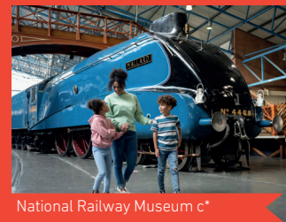
National Railway Museum c*