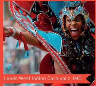
Leeds West Indian Carnival c JMO