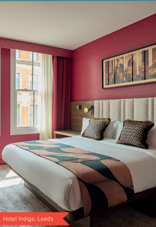
Hotel Indigo, Leeds