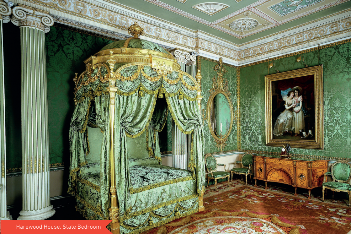
Harewood House, State Bedroom

Castle Howard is just a 30-minute drive from York city centre. Parking is free (there are occasions where parking charges are in place for certain events). A direct bus service, Route 81, runs from York to Castle Howard. House, Garden and Travel inclusive tickets are available on selected dates from April to October, with collection from York City Centre - The comfortable Mountain Goat Tours minibus leaves York twice daily.