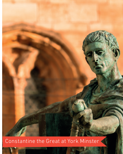
Constantine the Great at York Minster

The cities of Leeds and York are a must-visit for anyone wishing to walk in the footsteps of British royalty. Harewood House in Leeds and Castle Howard north of York are both ranked amongst the finest stately homes in the country. Both houses date back to the eighteenth century and, in their long illustrious histories, have hosted many Kings and Queens, including Queen Victoria and Queen Elizabeth II. More recently, each house continues to inspire as filming locations for historical shows and films including Victoria, Downton Abbey and Bridgerton to name a few.