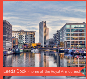
Leeds Dock, (home of the Royal Armouries)