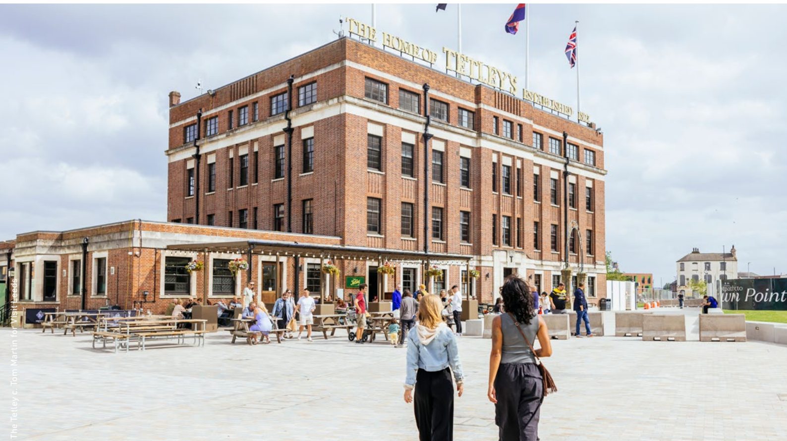
The Tetley

The UK's biggest touring country music festival heads to O2 Academy Leeds with line dancing, Rodeo Bulls and full-throttle vibes. academymusicgroup.com