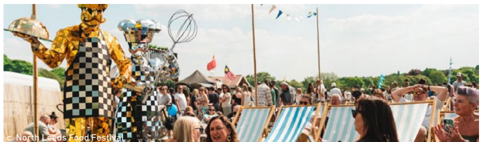
c. North Leeds Food Festival

Starting and finishing at Headingley Stadium, this marathon offers a challenging yet unforgettable 26.2-mile route through the beautiful countryside and communities of Leeds. A fitting tribute to Leeds Rhinos' sporting legend Rob Burrow. runforall.com