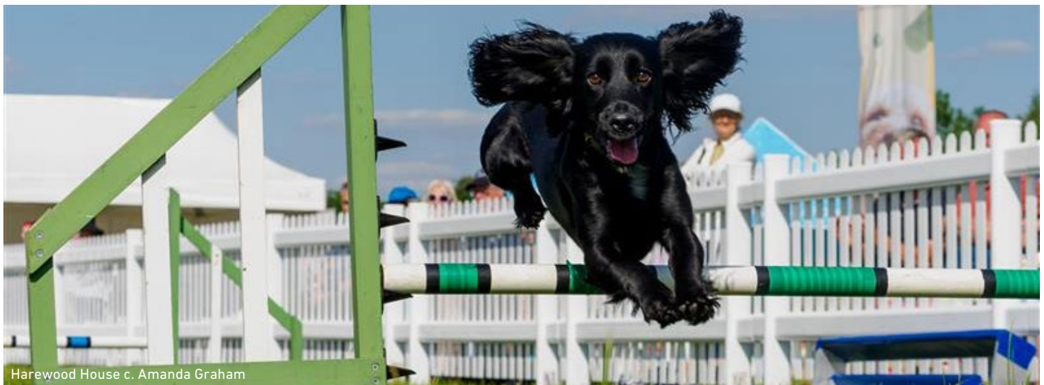
Harewood House

2026 marks the 44th year Leeds Championship Dog Show has been held at Harewood. Organised by the Leeds City and District Canine Association, it is one of the premier events for dog exhibitors across the UK. harewood.org