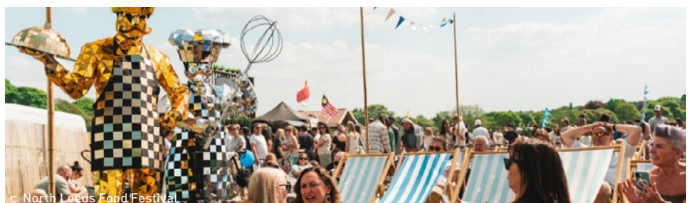
c. North Leeds Food Festival

Starting and finishing at Headingley Stadium, this marathon offers a challenging yet unforgettable 26.2-mile route through the beautiful countryside and communities of Leeds. A fitting tribute to Leeds Rhinos' sporting legend Rob Burrow. runforall.com