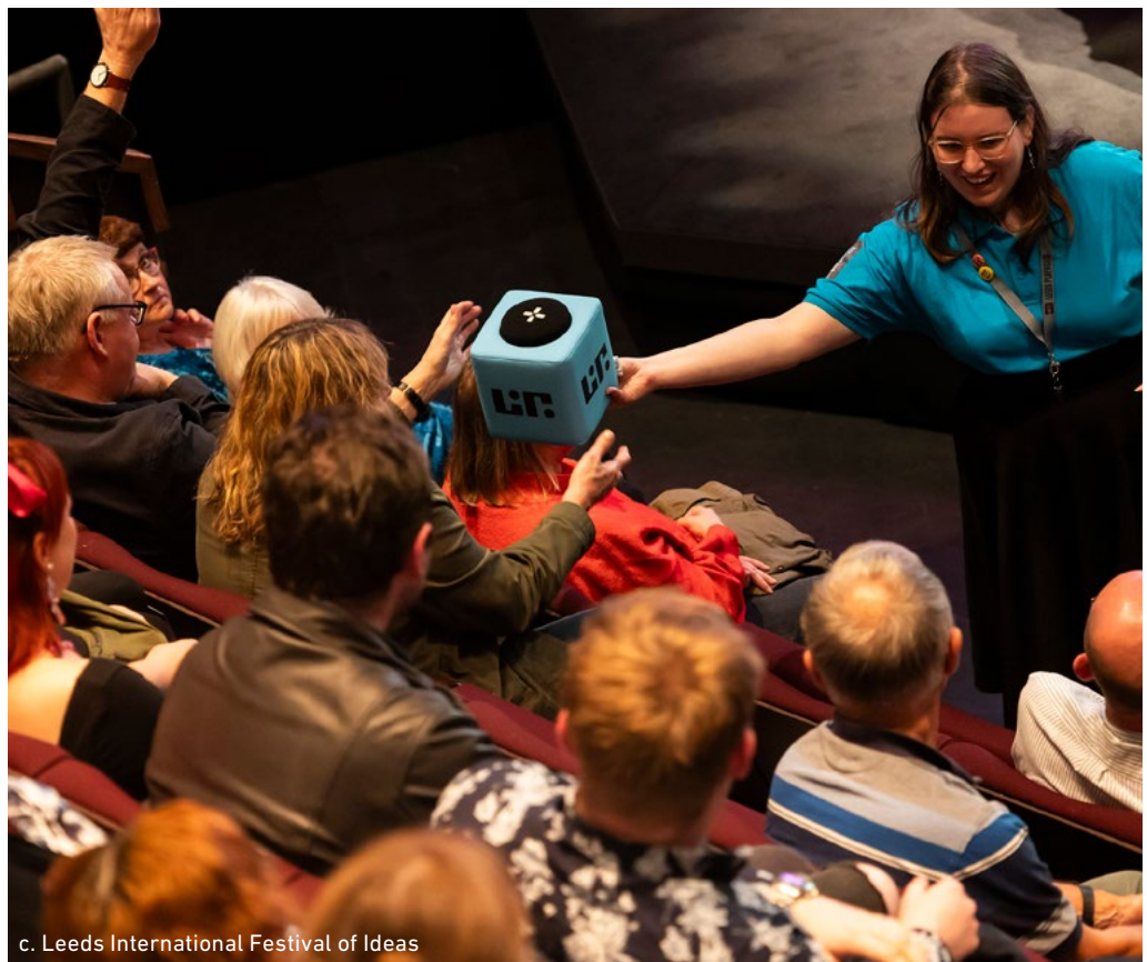
c. Leeds International Festival of Ideas