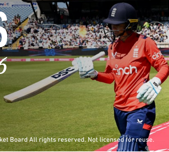
Headingley Stadium