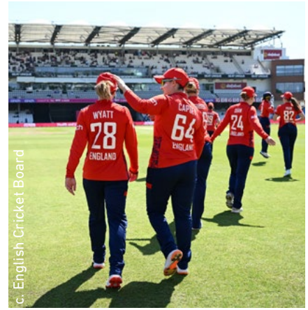
c. English Cricket Board

Experience world-class women's cricket at Headingley this summer with the ICC Women's International T20 World Cup. The iconic venue in Leeds is hosting five international matches - Australia vs Bangladesh (17 June) India vs The Netherlands (17 June), West Indies vs Scotland (18 June) England vs Scotland (20 June) and Australia vs Pakistan (23 June). Find out more