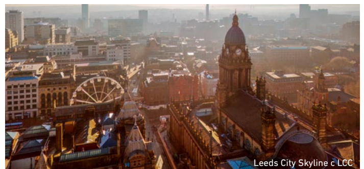
Leeds City Skyline