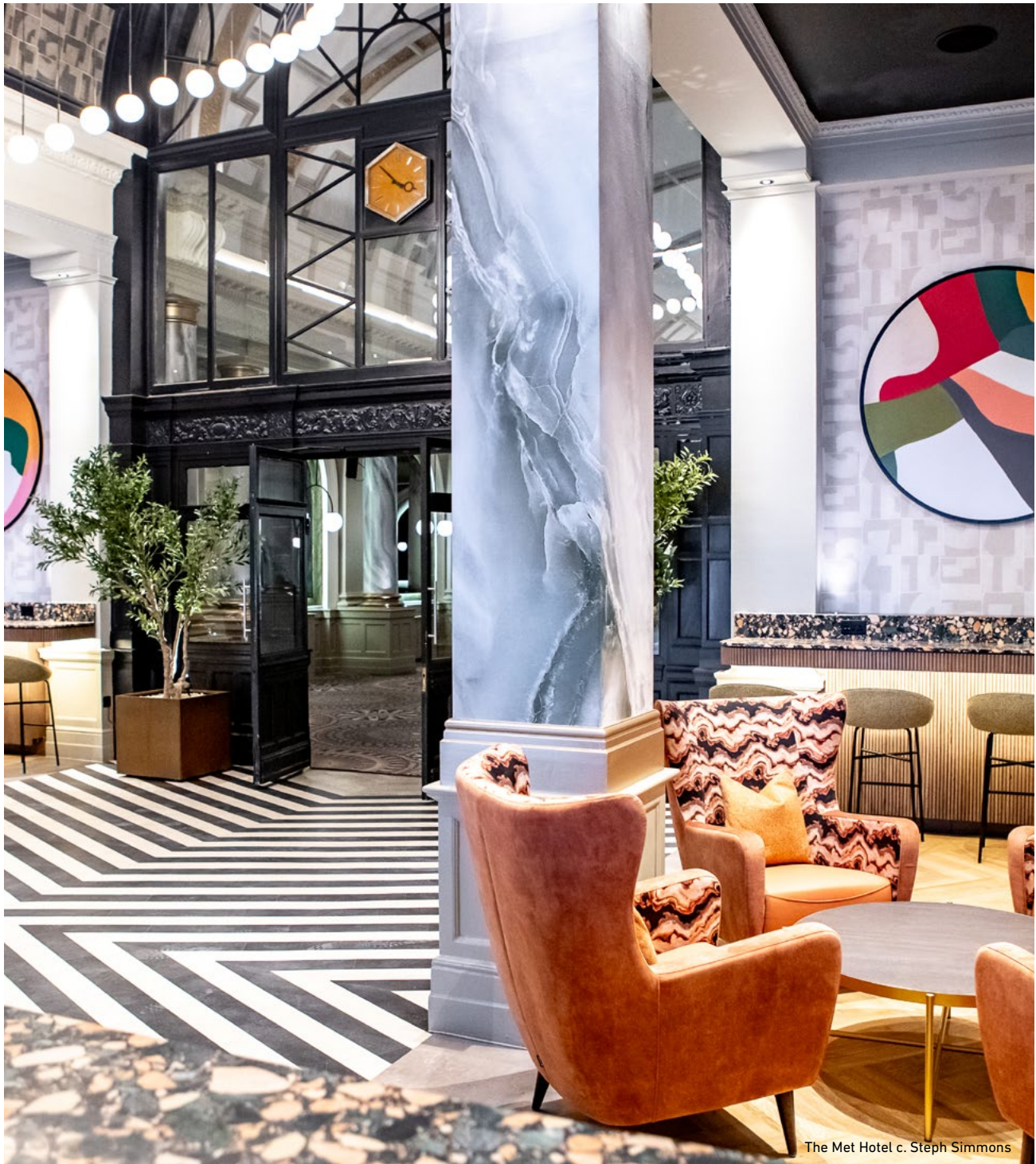
The Met Hotel

Whatever your trip entails and whatever your budget, you'll find somewhere to stay that's so much more than a base. With luxury and iconic hotels (Dakota and The Queens) and classic international brands like Radisson Blu, Malmaison, Marriott, Hilton City and Doubletree Hilton, plus a wealth of exquisite self-catering apartments and boutiques – the choice is yours!