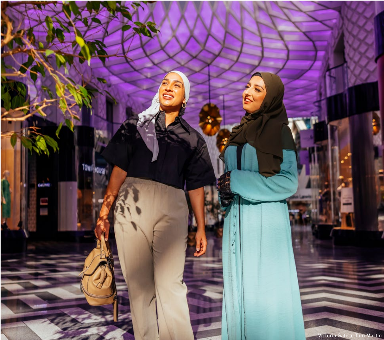
Victoria Gate, c Tom Martin

Leeds is a shopper's paradise. A world of retail, all within easy reach and on some of the most handsome, wide Victorian-made streets lined with striking buildings whose upper floors and rooftops mean shoppers should look up when in Leeds. Now pedestrianised, our compact and walkable city centre means you're never far away from the biggest brands. The stunning Victorian arcades, each with its own distinct identity, lead off the main shopping streets, so whether it's the Victoria Quarter – complete with the largest single work of stained glass in Great Britain and the largest stained glass roof in Europe – or the smaller Thorntons, Grand or Queens arcades full of eclectic and independent stores, salons and cafes, there's