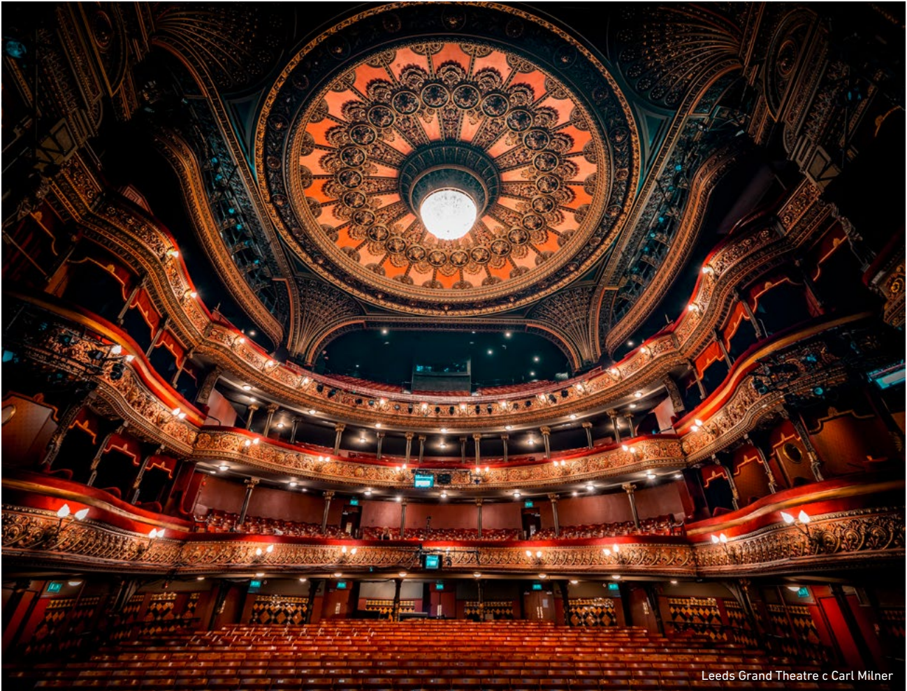
Leeds Grand Theatre

Throughout the year Leeds has a jam-packed programme of events, from award-winning theatre and ground-breaking exhibitions to city-wide festivals celebrating the city's heritage, creativity and communities. This includes Leeds Pride in July, which celebrates its 20th anniversary this year (2026), Leeds West Indian Carnival (Aug) and Leeds Black Music Festival (Aug), Leeds International Beer Festival (Sept), Leeds International Festival of Ideas (Oct), Leeds Light Night (Oct) and Leeds International Film Festival (Nov).