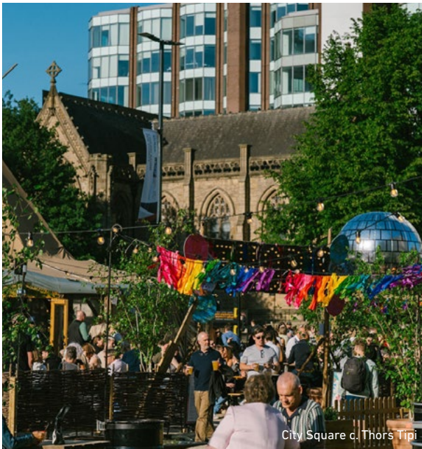
City Square c. Thors Tipi

Leeds' compact centre means that a walking tour is the perfect way to experience the city's culture and history .