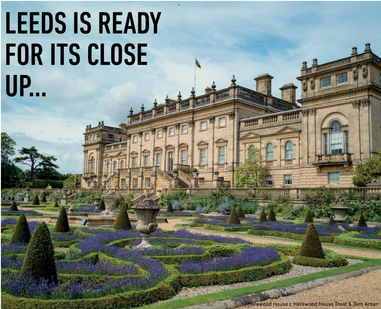
Harewood House

As featured in the first ever film, Leeds is a movie-star in itself. Back in 1888, Frenchman Louis Le-Prince - inventor of the first early motion-picture camera - created the first moving picture on paper film featuring Leeds Bridge.