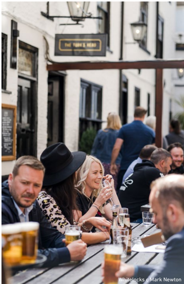
Whitlocks